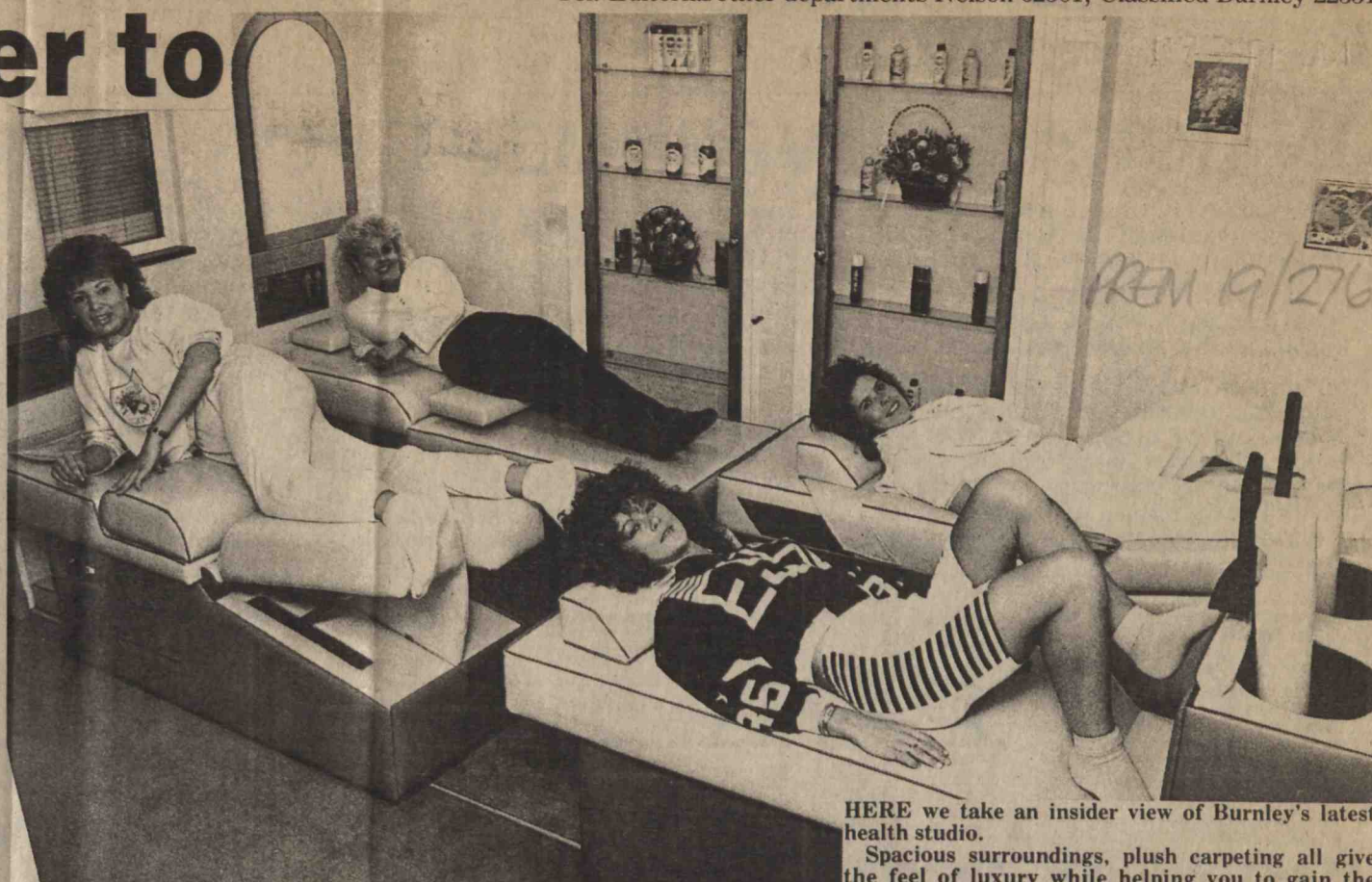
HERE we take an insider view of Burnley's latest health studio.

His idea was so successful that now over 10,000 outlets across the whole of America offer their health and body conscious clients this marvelous new breakthrough in muscle and body toning.